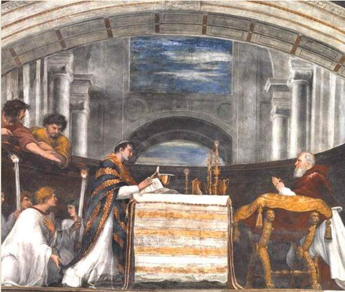
The Mass at Bolsena, Raphael, 1512-1514, Apostolic Palace, Vatican Museums, Vatican City