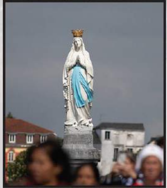
Come and wash in the Lourdes water

St. Anne and Our of Lady La Vang Parish 929 N. Duke St., Lancaster www.stannechurch.org